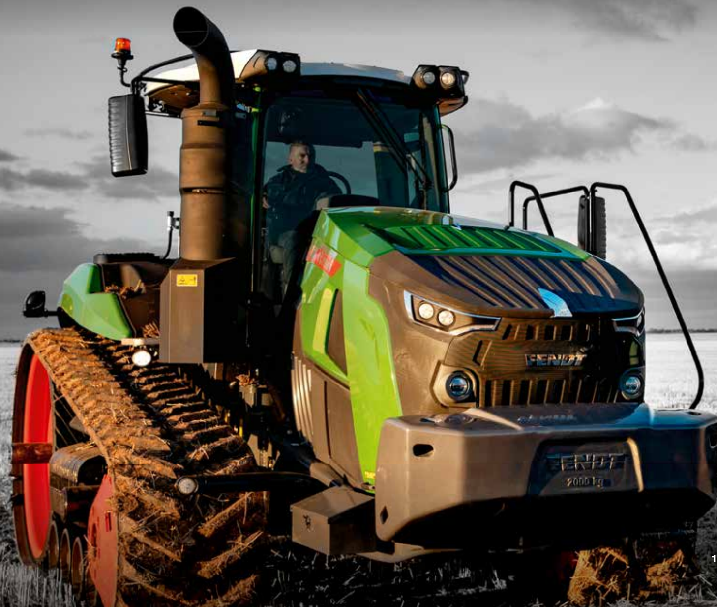
1100 Vario MT

The heavyweight that's light on its feet.