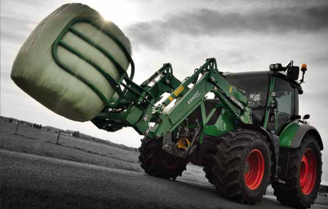
300 Vario with Bale Grab