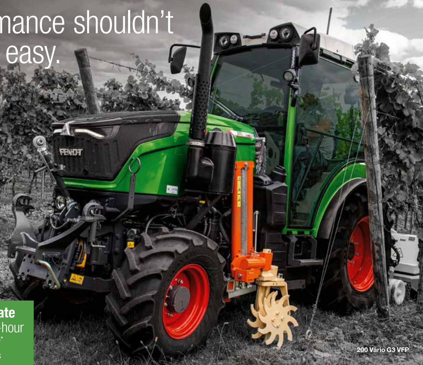
200 Vario G3 VFP