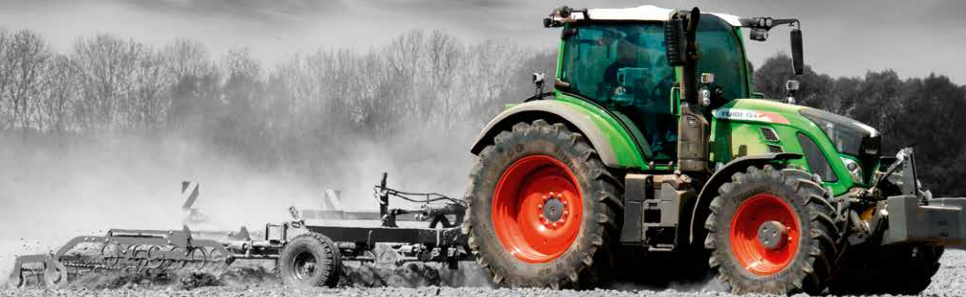
700 Vario G6