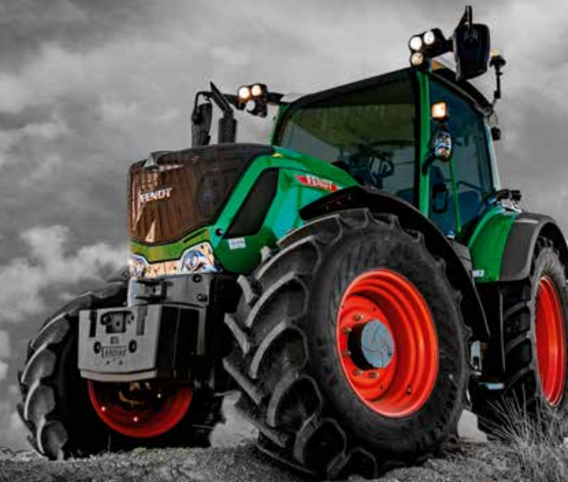
300 Vario G4