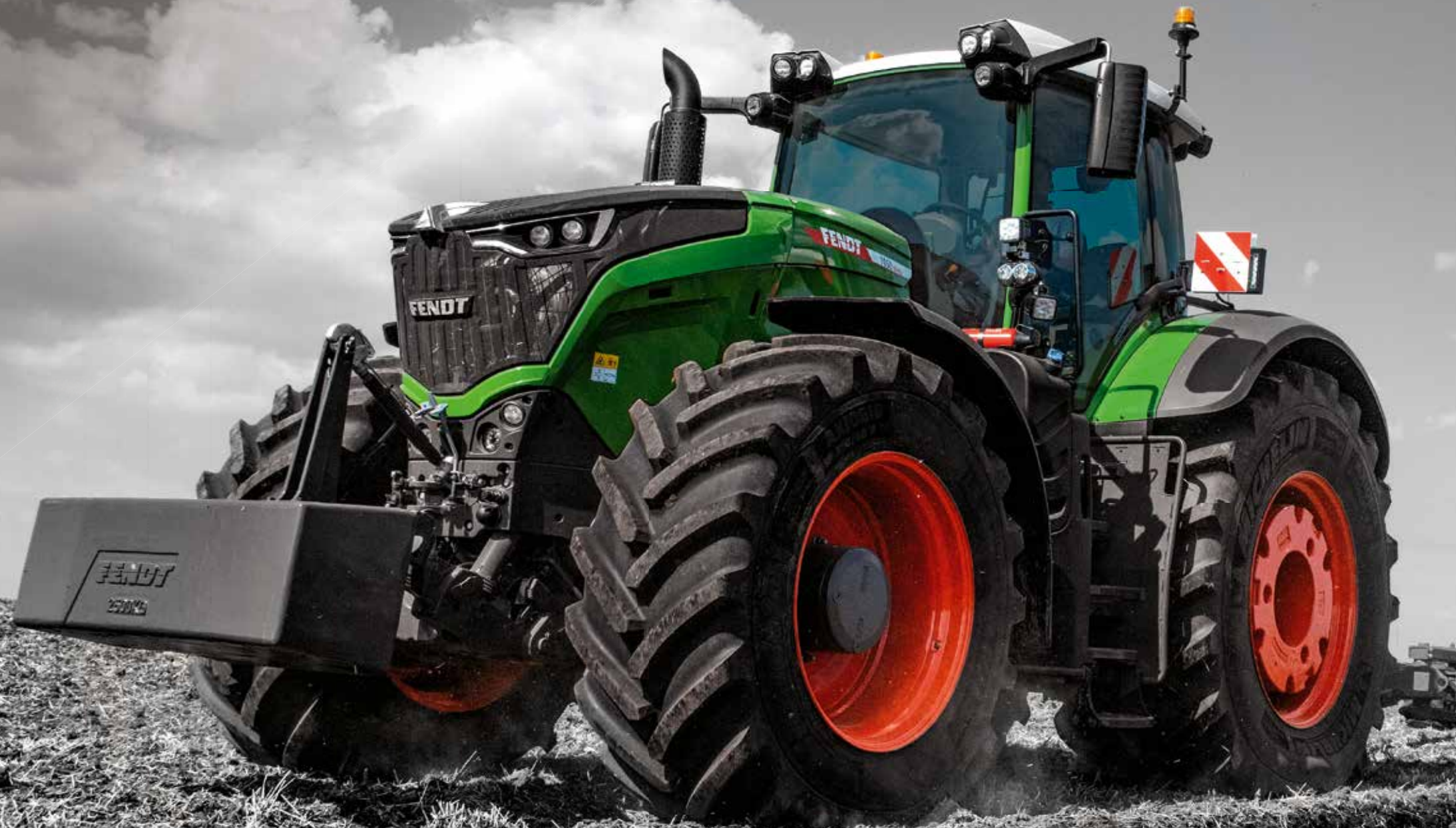
1000 Vario G2

Fendt are machines for people who know what they want. People who want quality, reliability and unparalleled performance. And right now, as part of our Early Order Program, you can receive 0.99% finance across wheeled tractors, tracked tractors and IDEAL combines. Now's the perfect time to back your business with the best of the best.